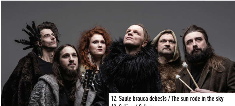
13. Selēna / Selena