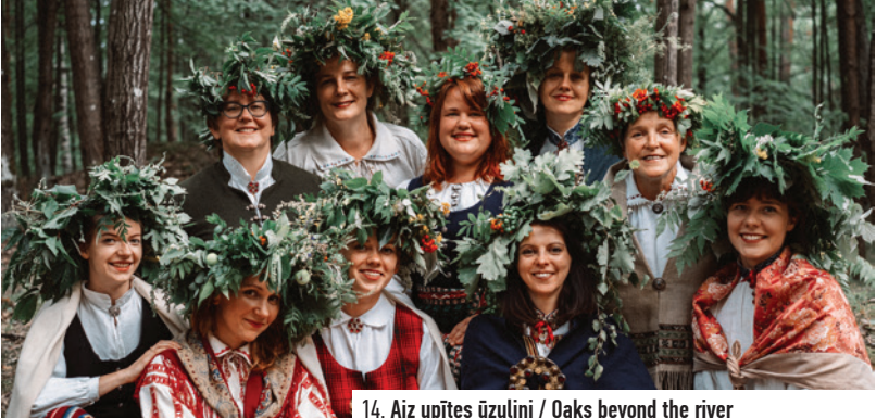
14. Aiz upītes ūzulini / Oaks beyond the river 15. Pļaunit, bruoļi, pūrva pļovas / Mow the meadows, brothers