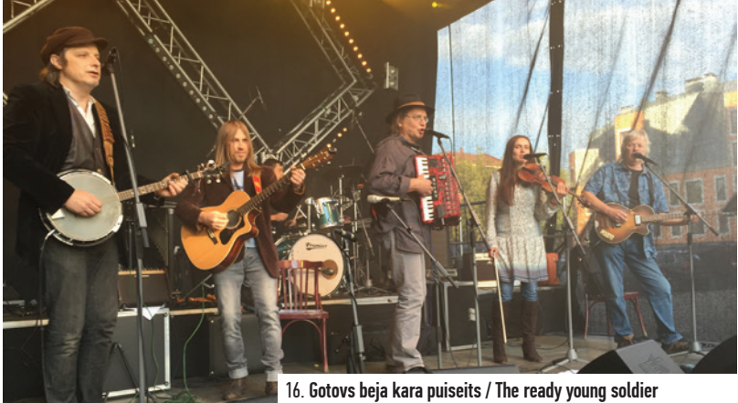
17. Viens bēdīgs puika staigāja / A sad young man was wandering