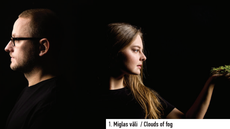
2. Urbānās dzīres / Urban feast